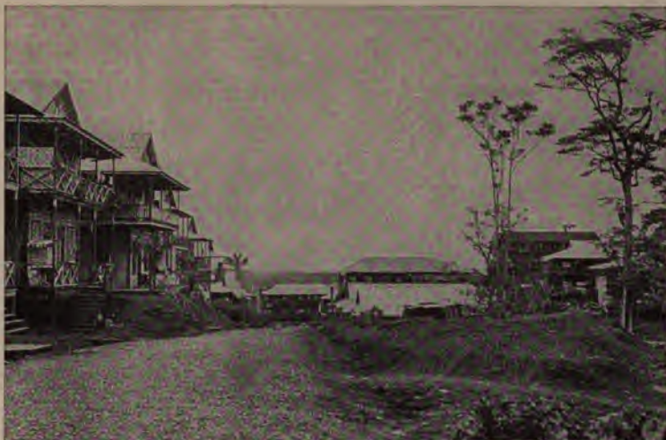
Down the beat in New Gatun, the Caribbean in the distance